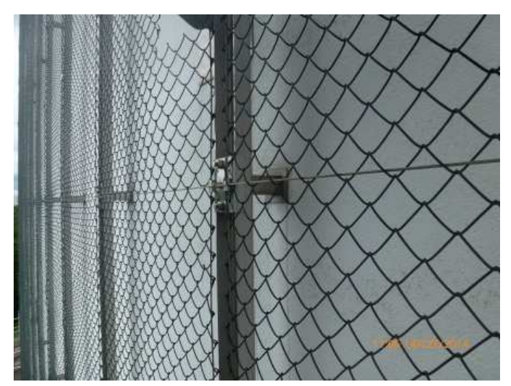
Fig. 6. Construction for green wall - Philharmonic Hall in Białystok

Changes in this respect are taking place not only in Poland. Also in systems of multi-criteria building evaluation, such as LEED or BREEAM, additional points can be gained, without which achieving the highest marks may prove to be