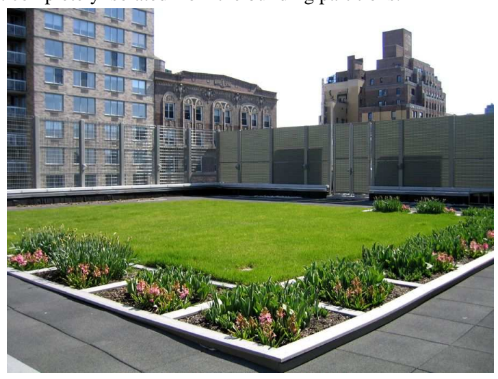
Fig. 1. Example of a green roof [7]

developed, both in terms of insulation layers as well as the actual construction. Ecological systems make it possible to take advantage of greenery while keeping it completely isolated from the building partitions.