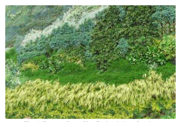
Fig. 4. Green wall as a Van Gogh painting - London

Despite their innovative nature and indisputable positive influence on people and the environment, many people remain skeptical in regards to the above-presented solutions. This very often results from the lack of skills exhibited by the builder, or the lack of proper assessment at the planning stage, as there have been cases where water leakage or the premature death of plants took place.