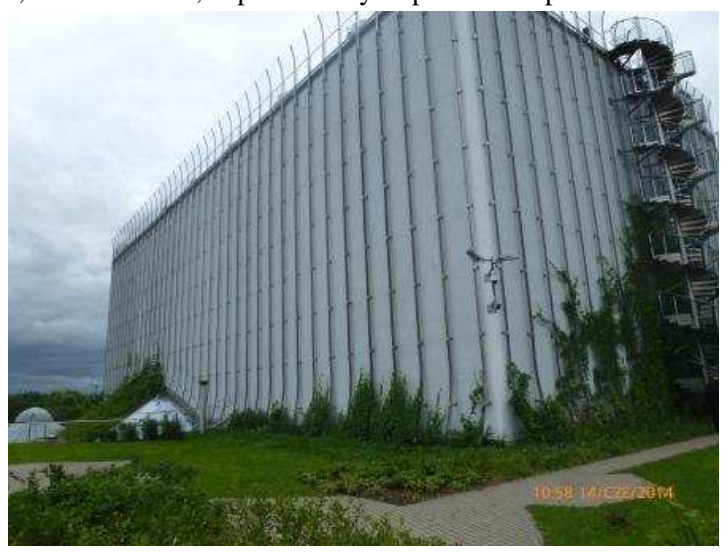
Fig. 5. Example of green wall - Philharmonic Hall in Białystok

the possibility of increasing the surface area of the building, thus also the usable area which, as it is known, is particularly important for potential investors.